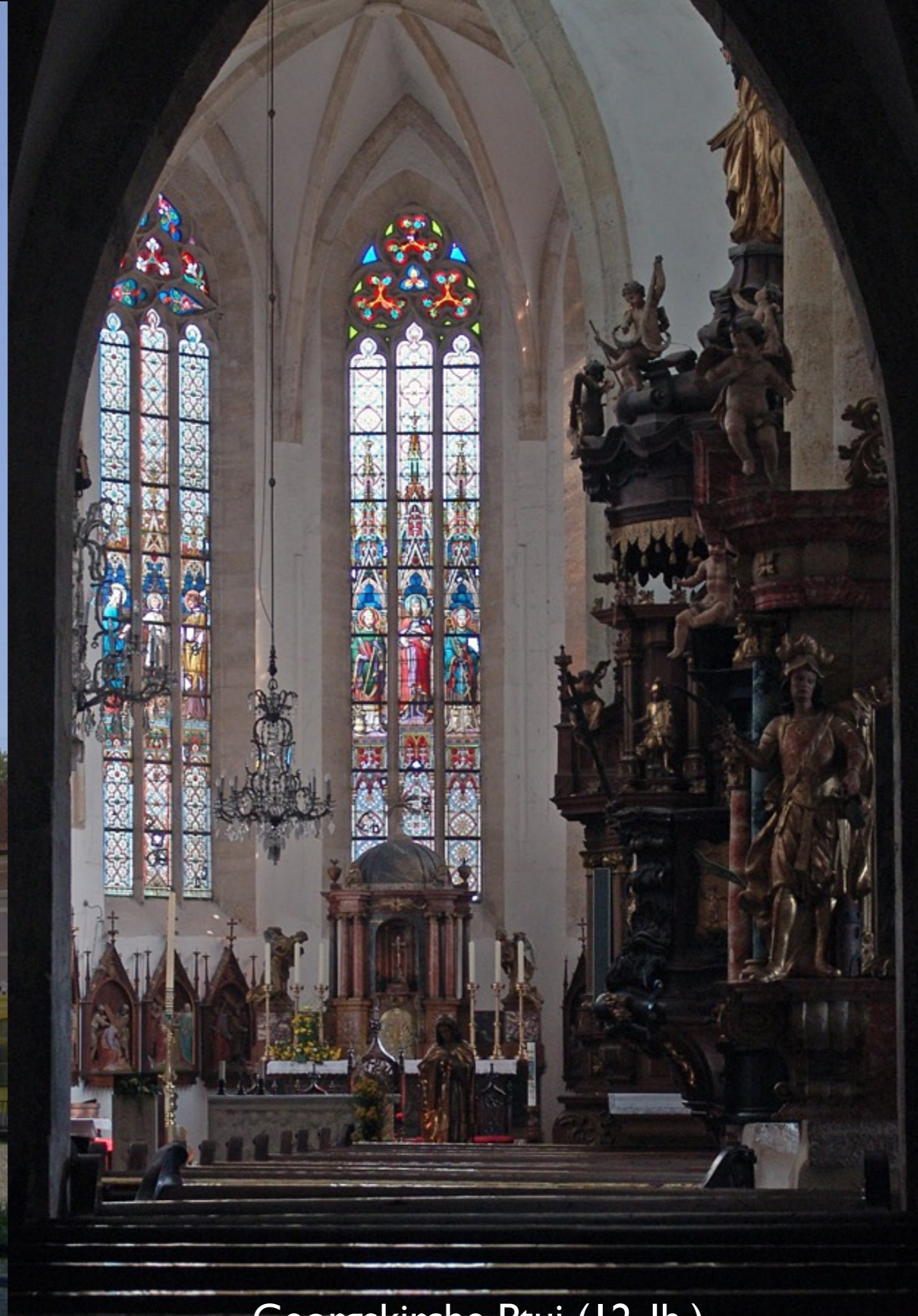
Georgskirche Ptuj (12. Jh.)