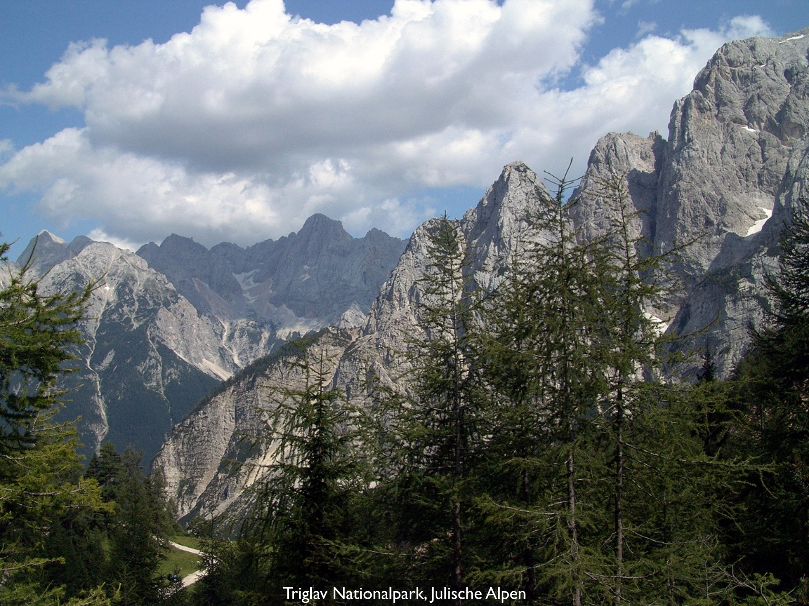
Triglav Nationalpark, Julische Alpen