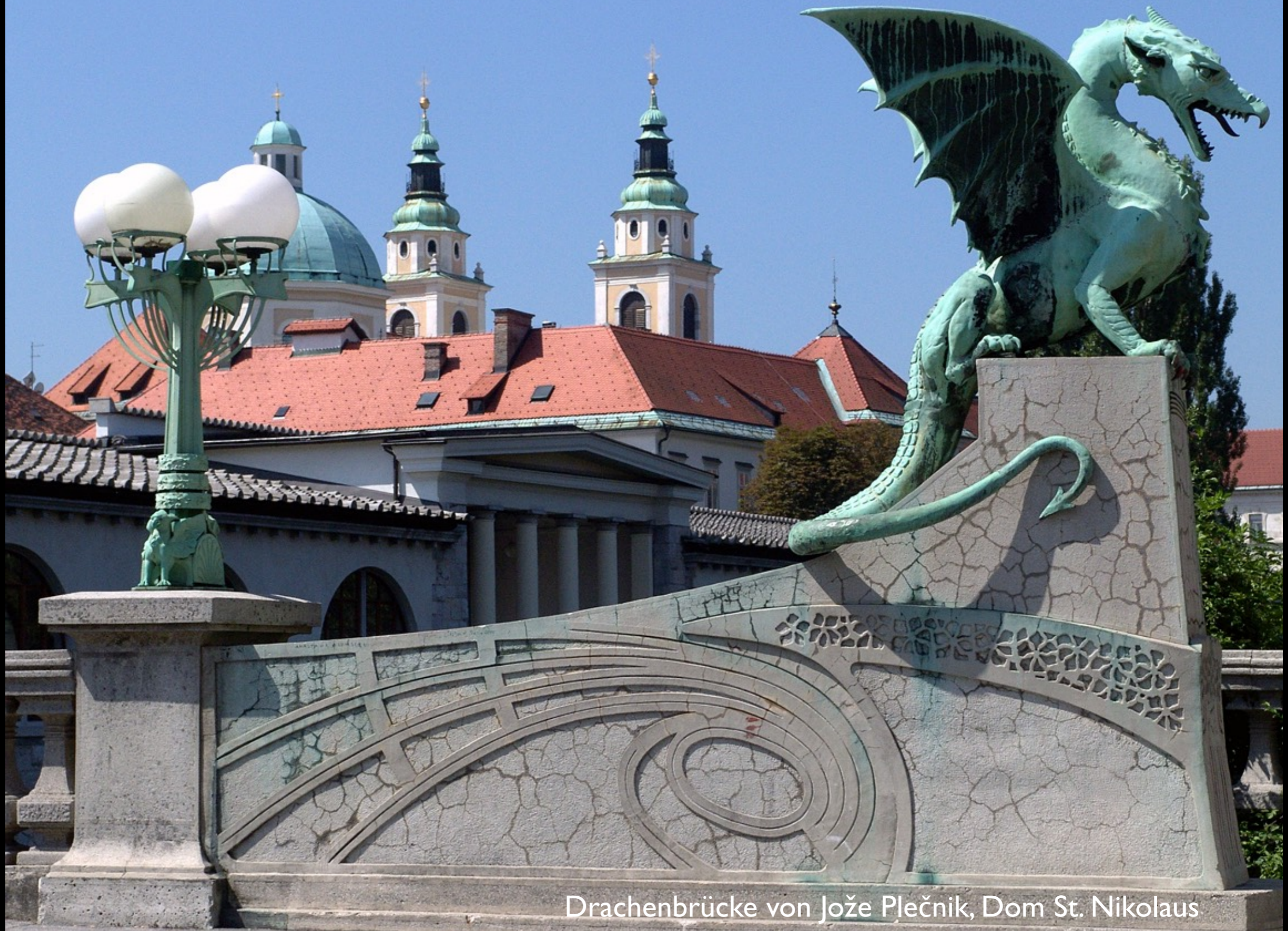
Drachenbrücke von Jože Plečnik, Dom St. Nikolaus