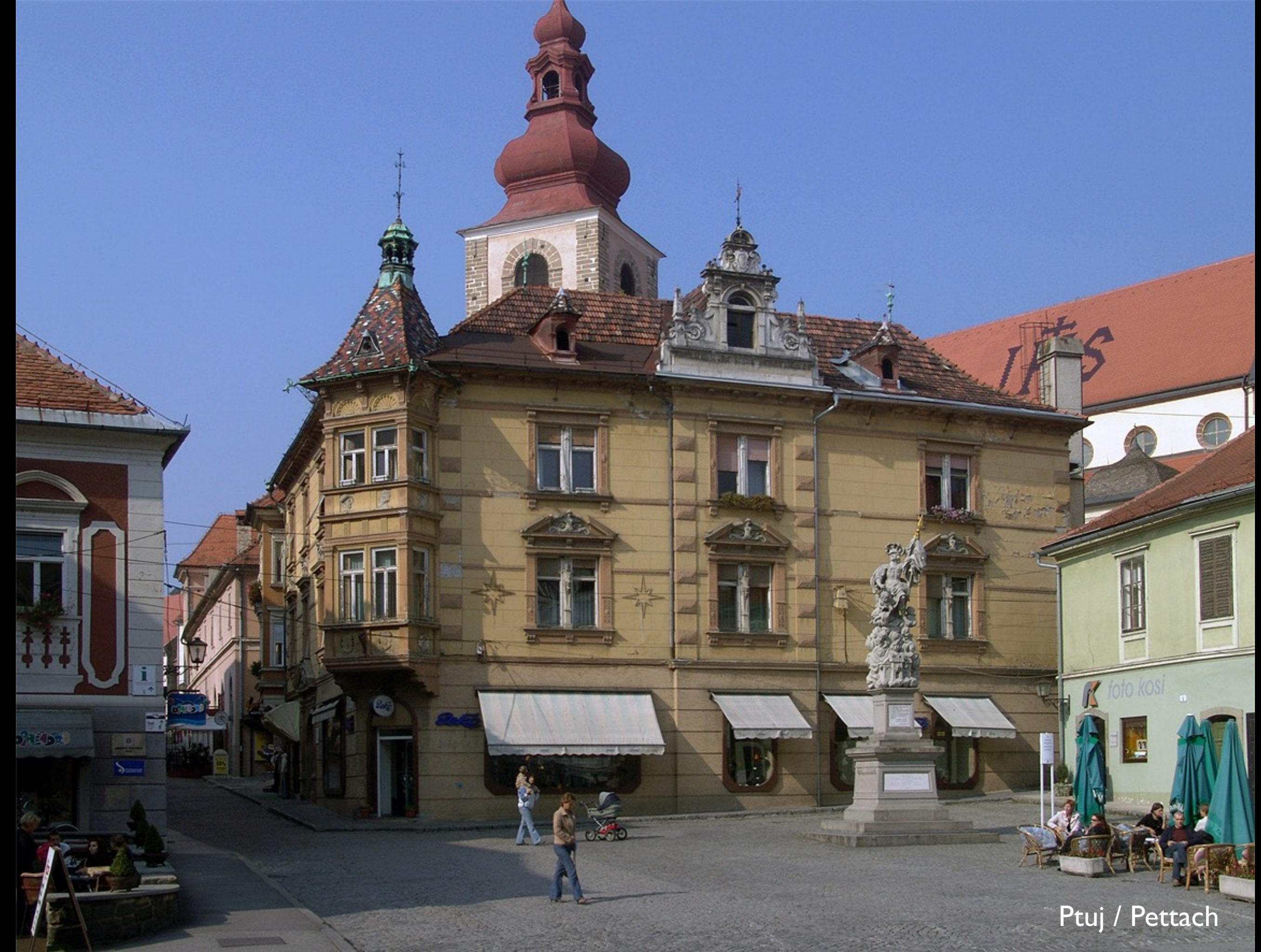
Ptuj / Pettach