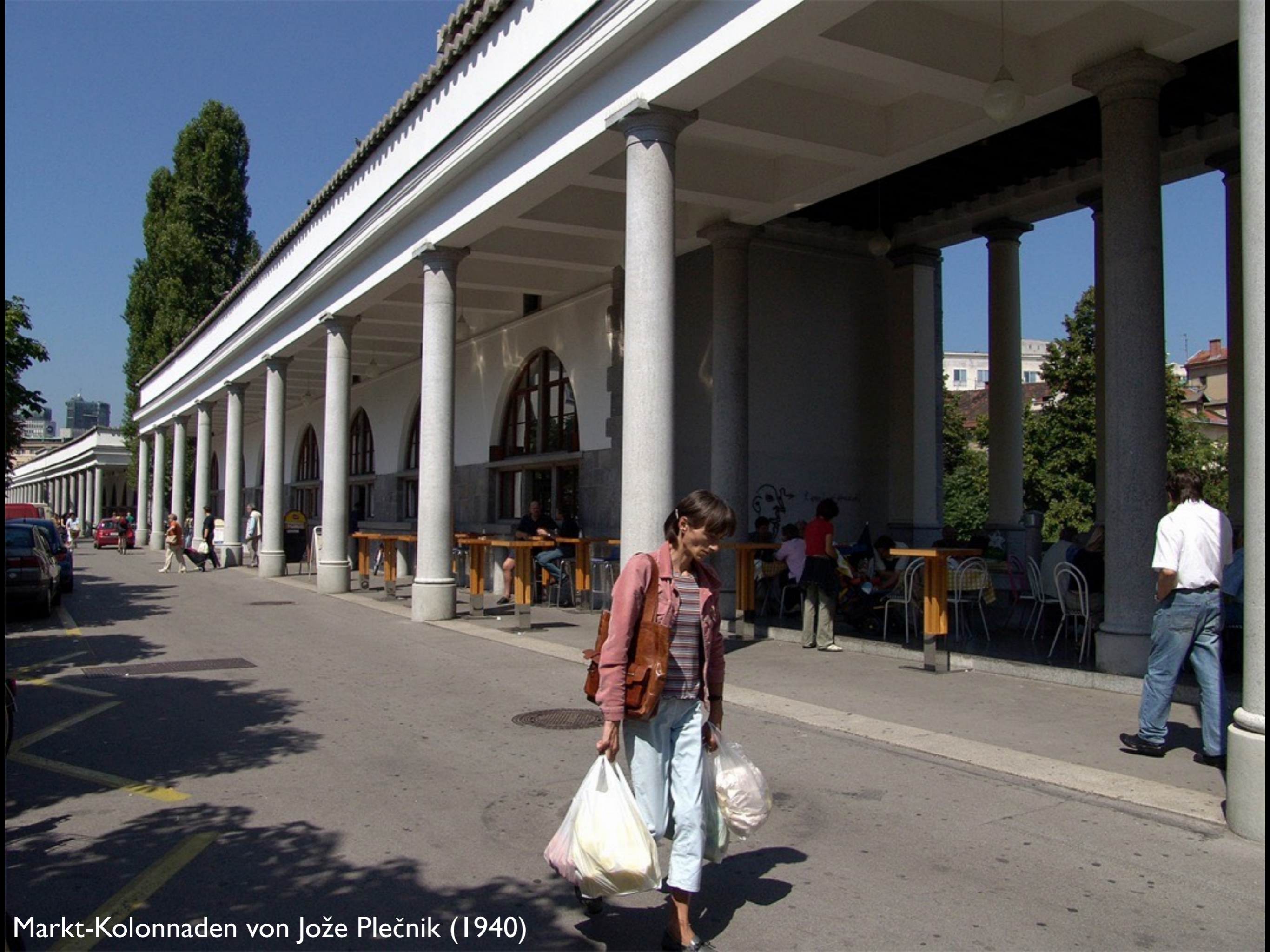
Markt-Kolonnaden von Jože Plečnik (1940)