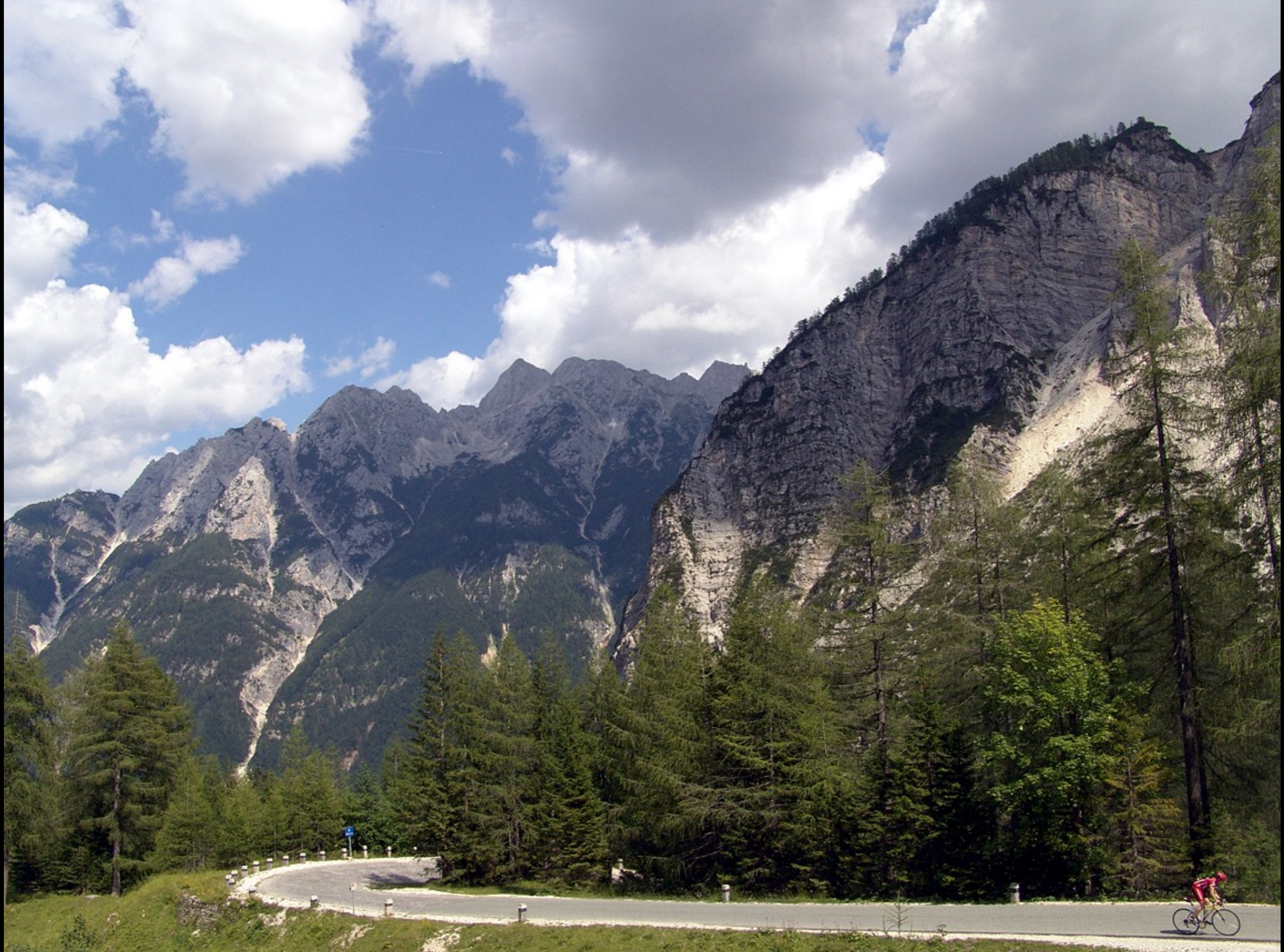
Triglav Nationalpark, Julische Alpen