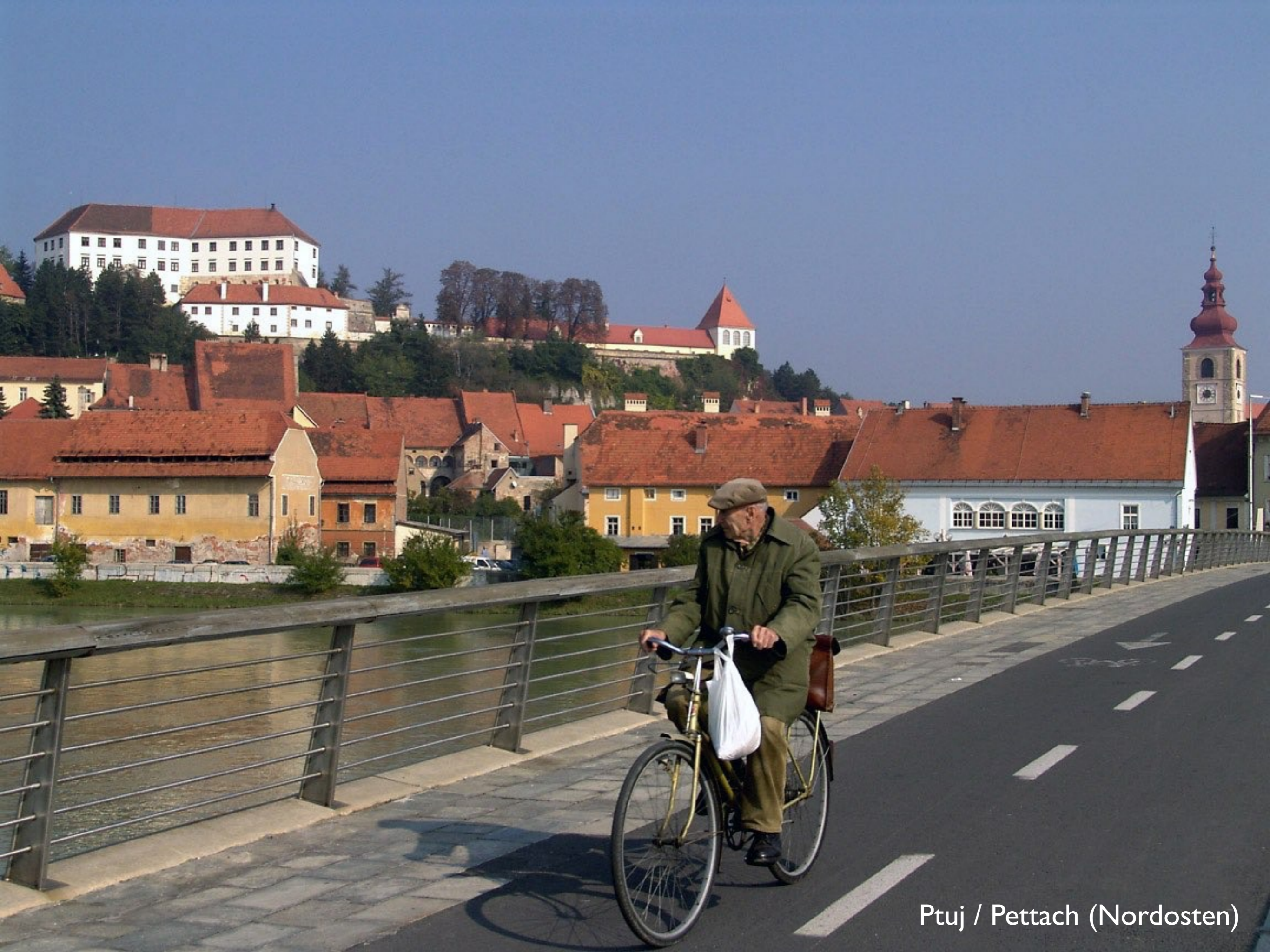
Ptuj / Pettach (Nordosten)