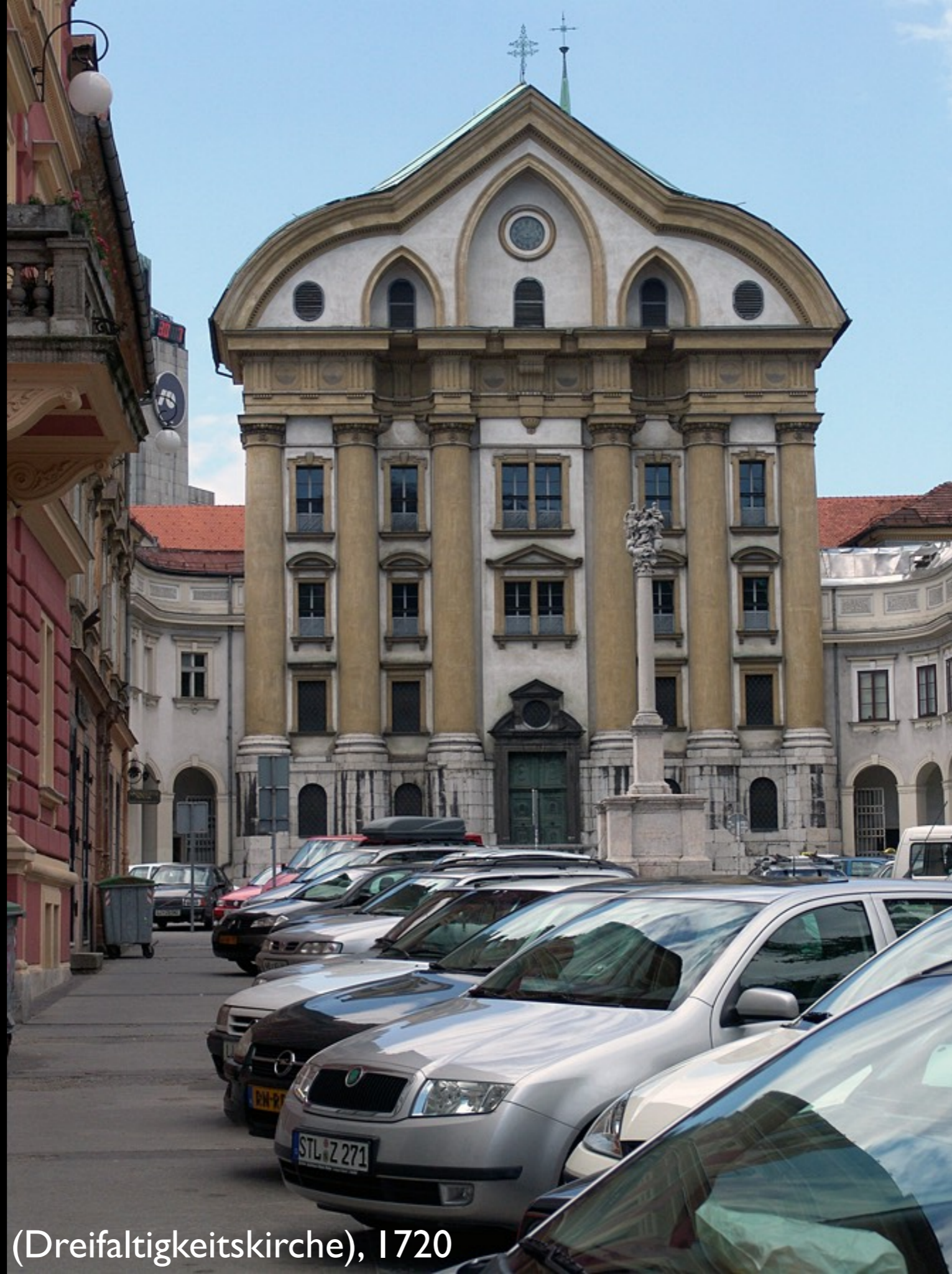
Ursulinenkirche (Dreifaltigkeitskirche), 1720