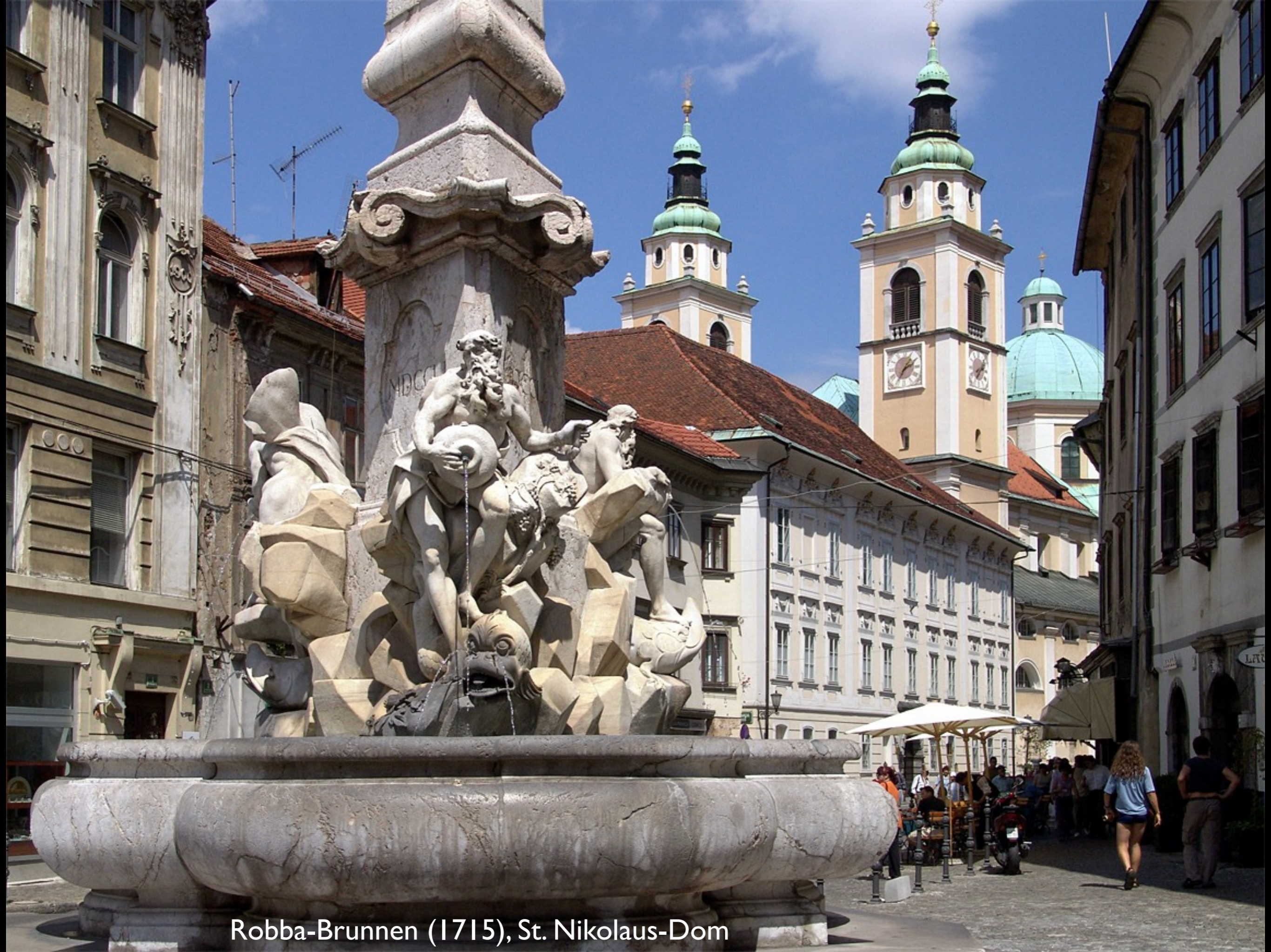
Robba-Brunnen (1715), St. Nikolaus-Dom